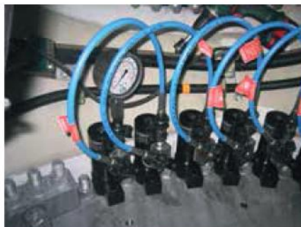
Tower bolt tensioning