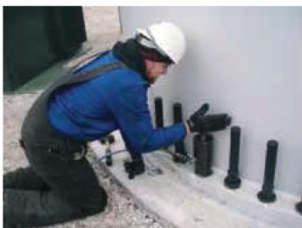
Foundation bolt tensioning