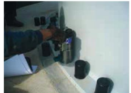
Foundation bolt tensioning